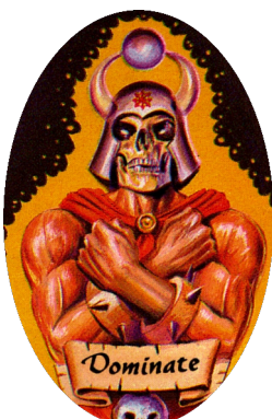
Mind Blast and Dominate Spell Tokens

The Chaos Sorcerer and defender both roll dice equal to their Mind points.