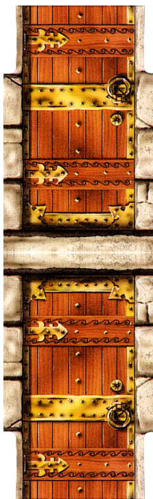
Wooden Exit Door

The Chaos Sorcerer and defender both roll dice equal to their Mind points.